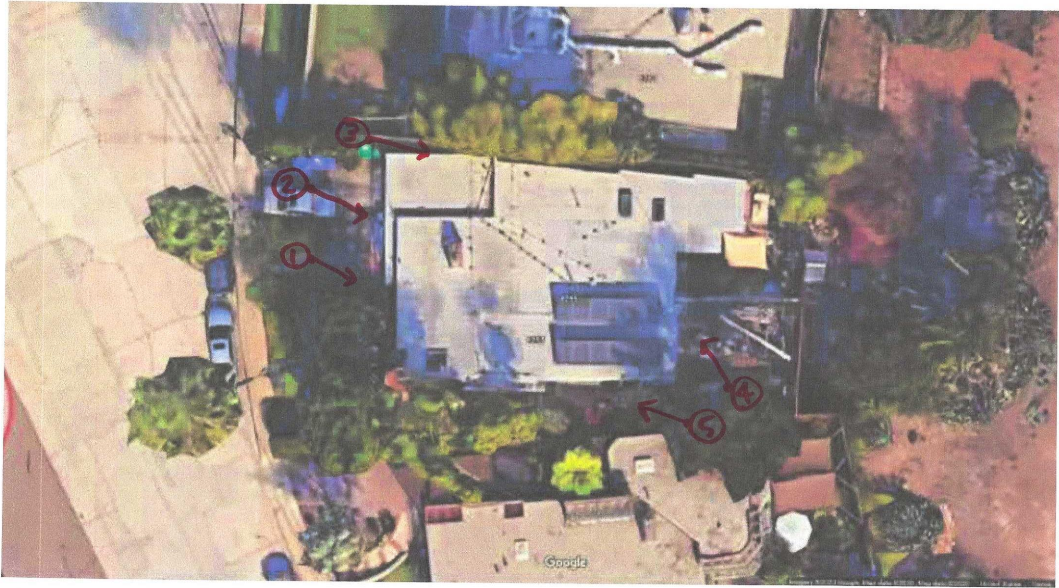
6253 Dowling Dr