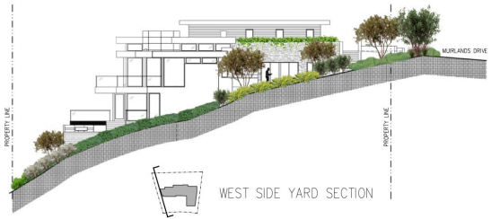
WEST SIDE YARD SECTION