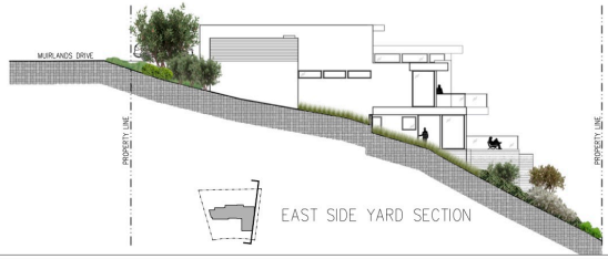
EAST SIDE YARD SECTION