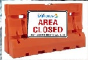
K-Rail Plastic Water Filled Barrier with "AREA CLOSED" sign attached placed here to block access.

Stair Access Point: A chain with an "AREA CLOSED" sign attached will be connected to the hand railings across the top step to block access.