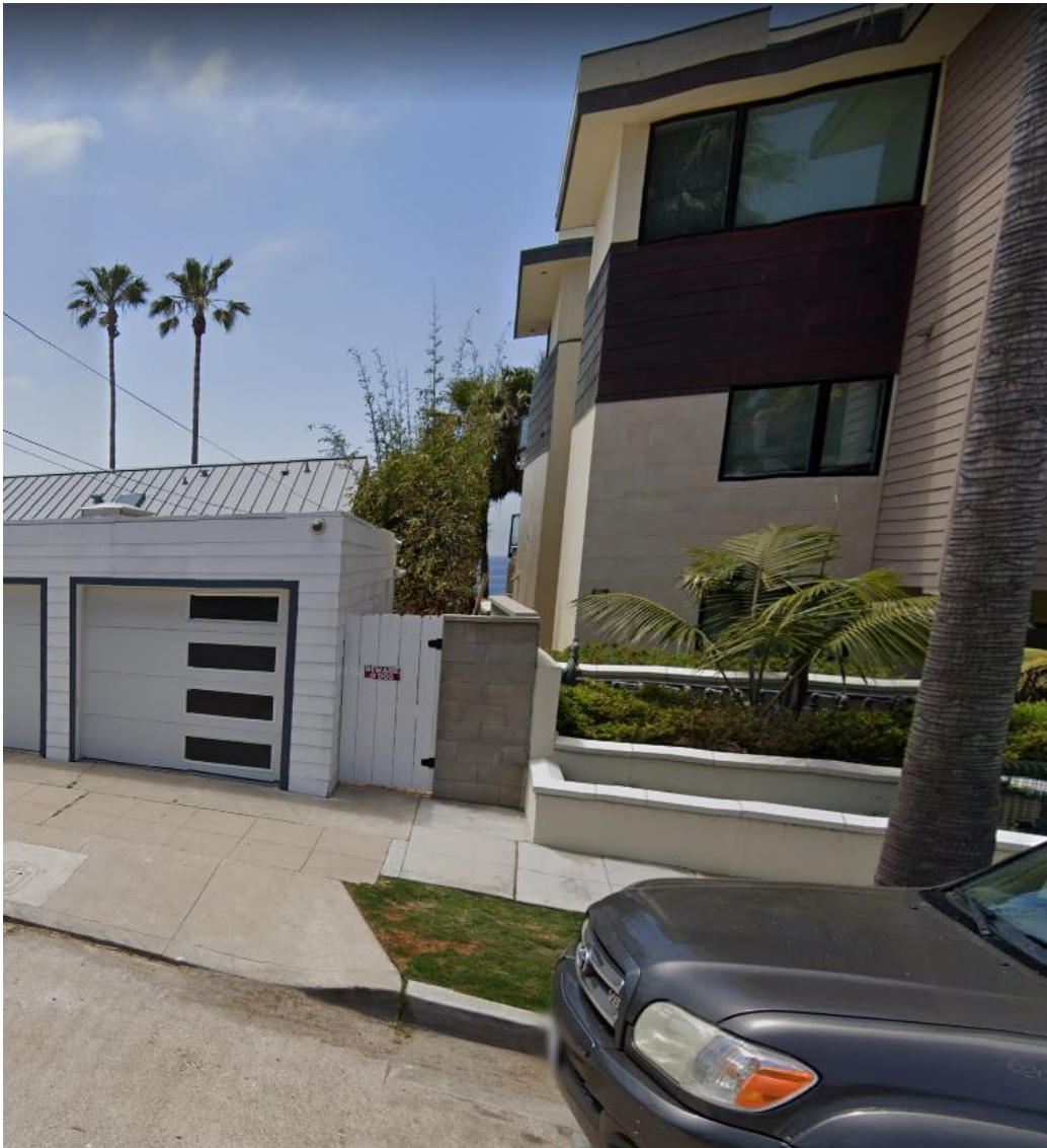
Side yard setback compared to neighbor