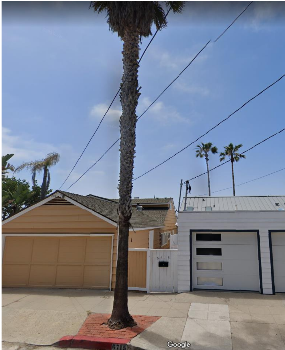
Side yard south side setback