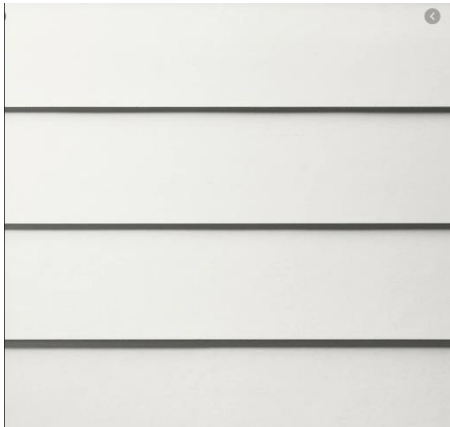
James Hardie Siding 8.25x144 in. Color plus HZ5 Arctic White