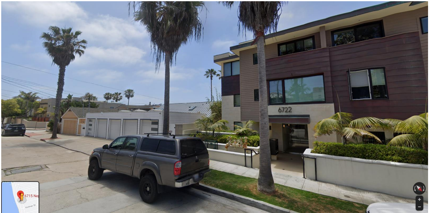
View of the street looking South