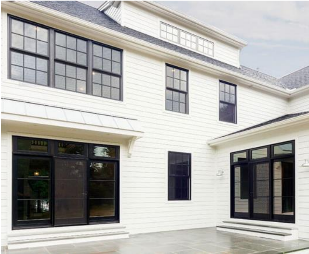
White siding and black windows