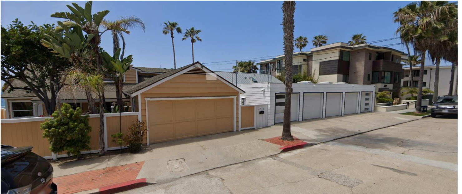
North view of property