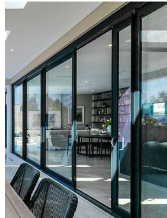
Fleetwood Doors and windows