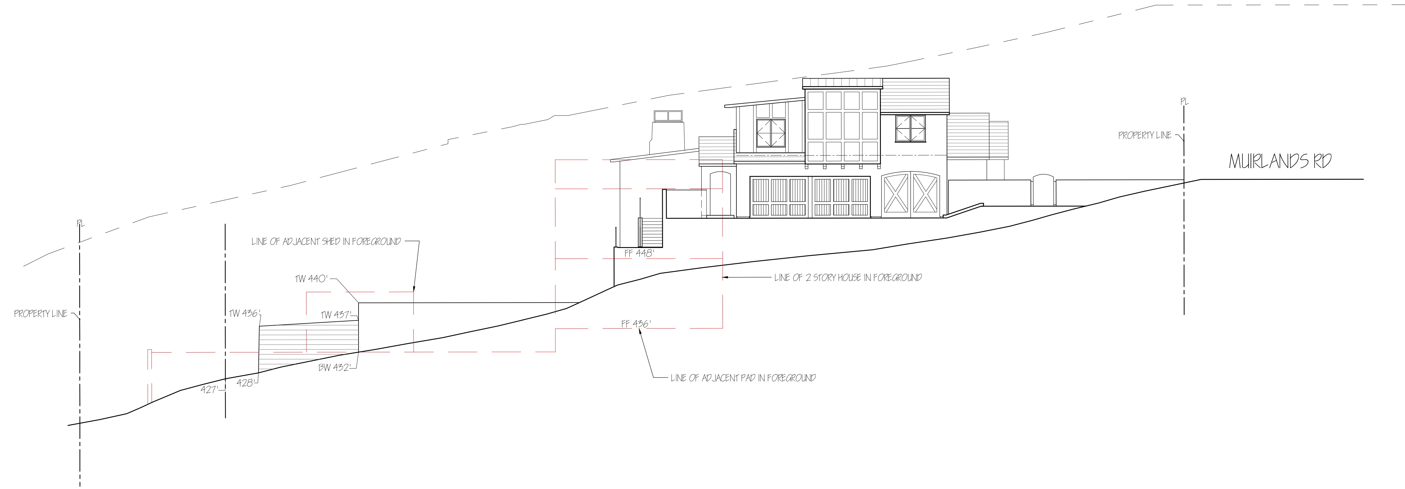
SECTION DD @ WEST PL SCALE: 1" = 10'-0"

CARRAHER RESIDENCE 1136 MUIRLANDS DR. LA JOLLA, CA 92037