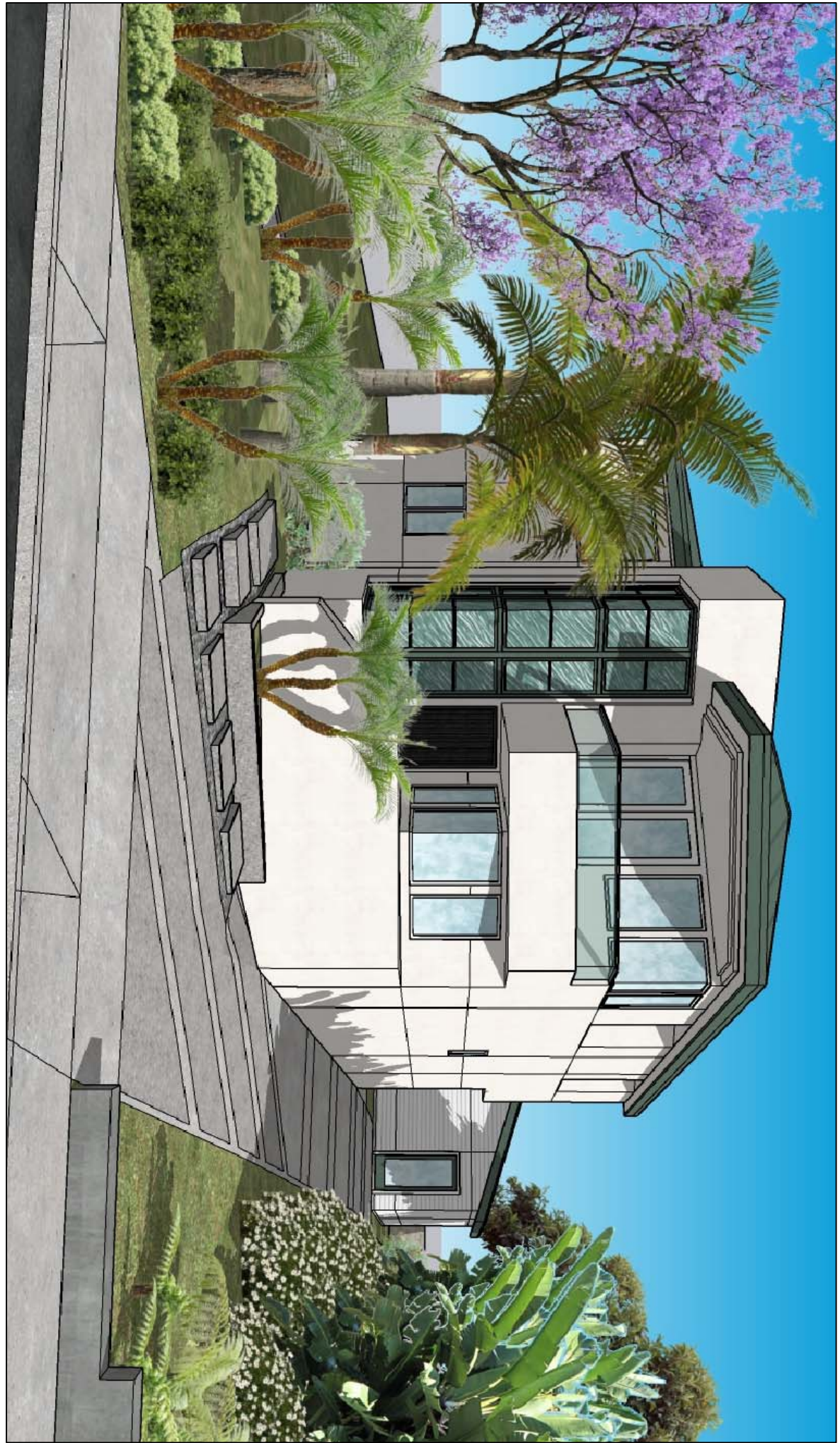
DRIVEWAY VIEW CONCEPT