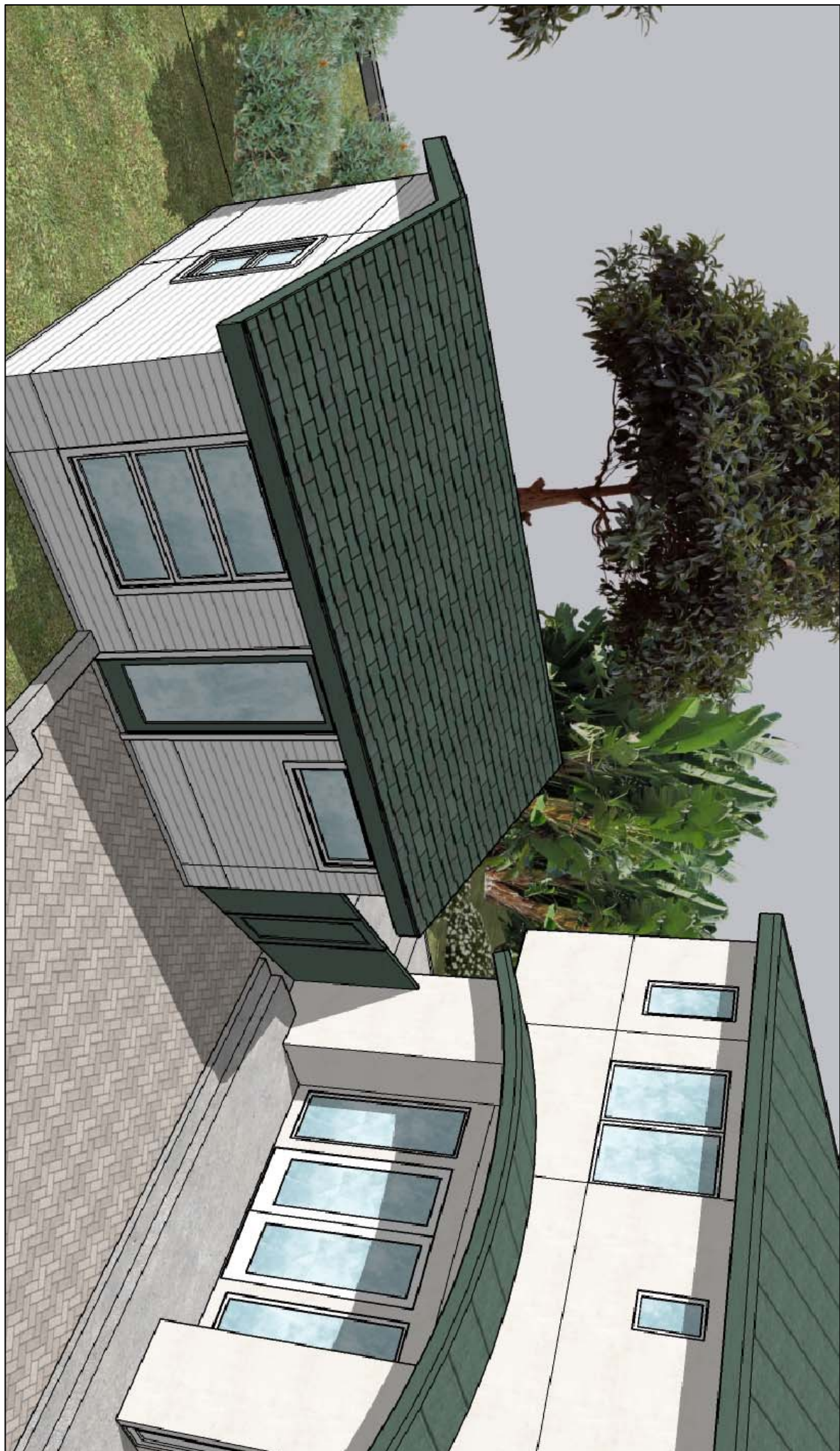
ADU VIEW CONCEPT

Note: THESE RENDERINGS REPRESENT THE OVERALL DESIGN INTENT AND DO NOT REFLECT THE CURRENT DETAILED PLANS, SECTIONS AND ELEVATIONS. THESE SHOULD ONLY BE REFERENCED FOR GENERAL SITE INTENT, CONTEXT AND SCALE.