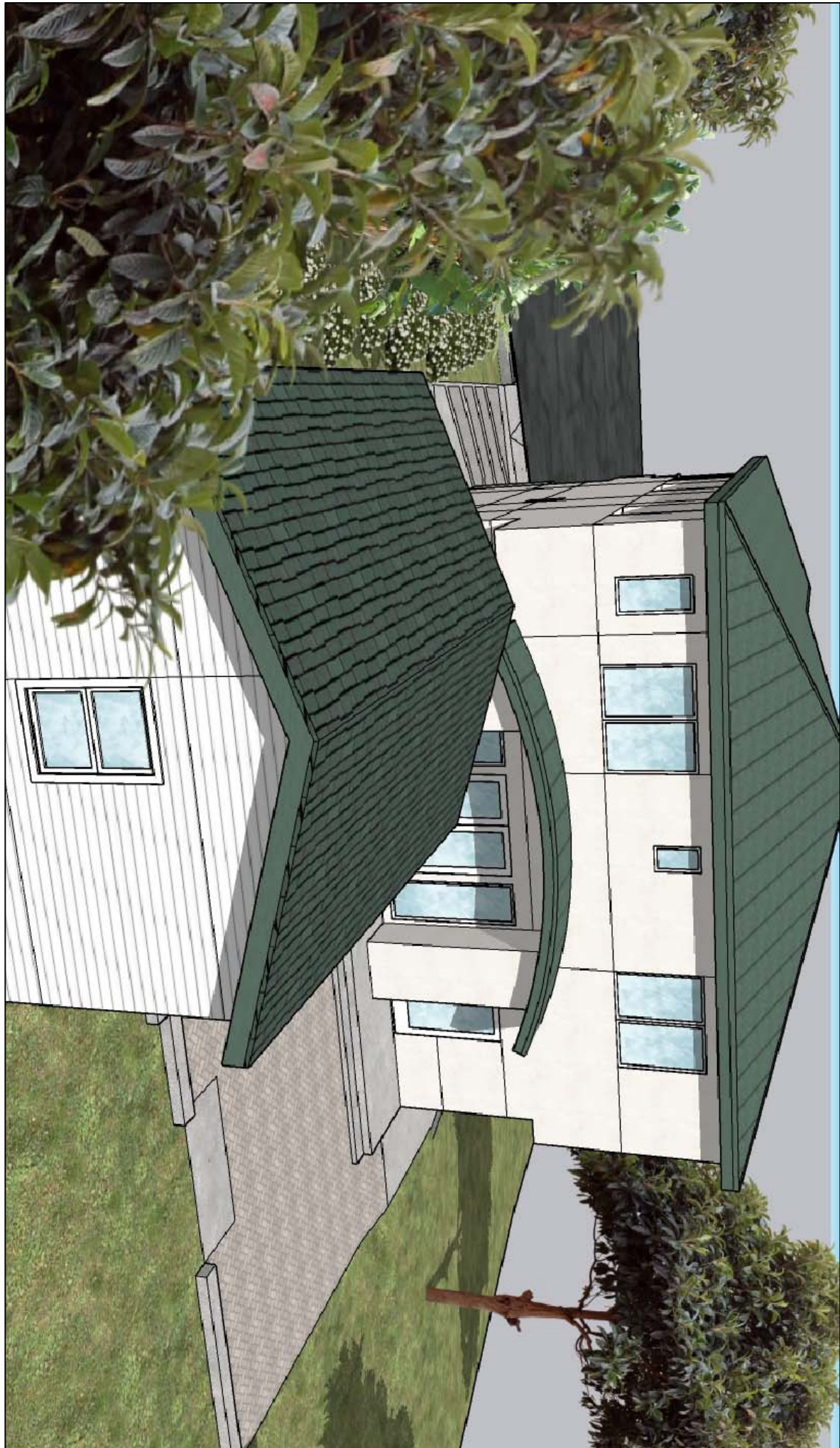
ADU VIEW CONCEPT